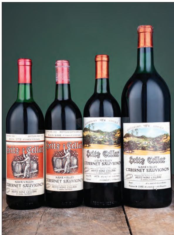
Lots 1197, 1198, 1200, 1201