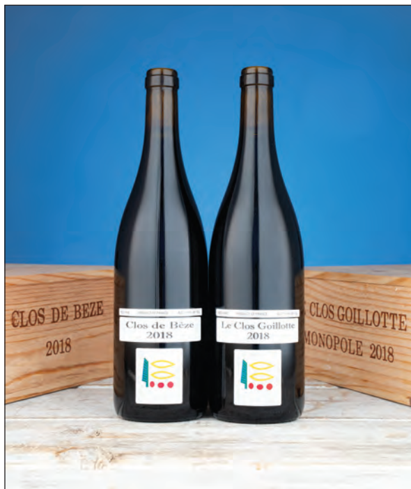
Lots 326, 329